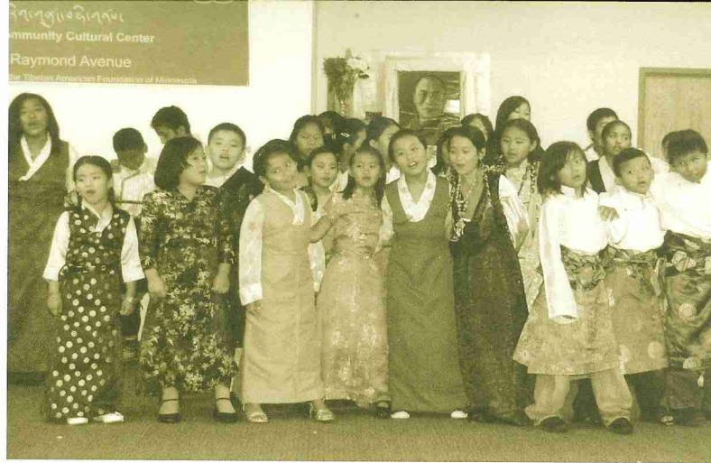
Tibetan Cultural School students singing, St. Paul, 2008

T HROUGHOUT STATE HISTORY, many immigrants have come to Minnesota planning to return home after achieving their goals of education and wealth or, in